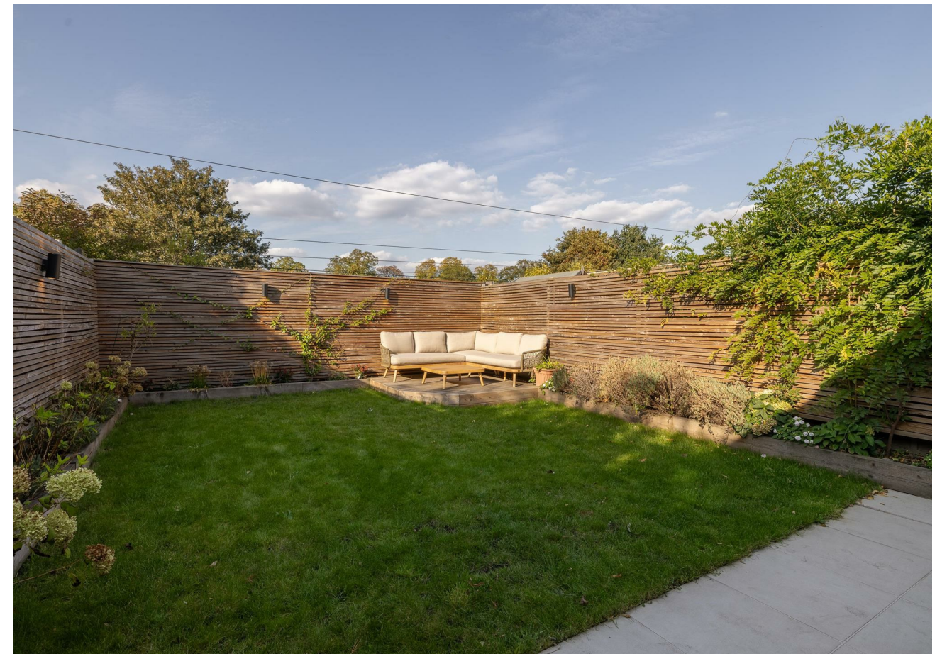
Garden 20'0" x 28'2"